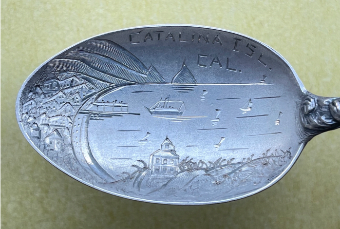
on Coddling Bros. & Heilborn - figural fish - mono "1903"